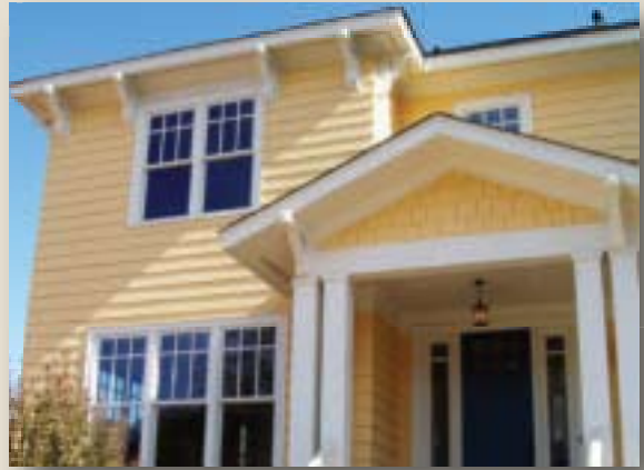
Sierra Premium™ Smooth - Painted