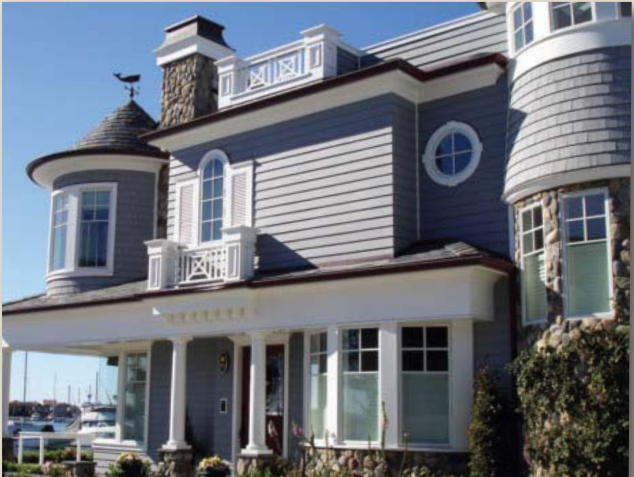
Sierra Premium™ Smooth - Painted