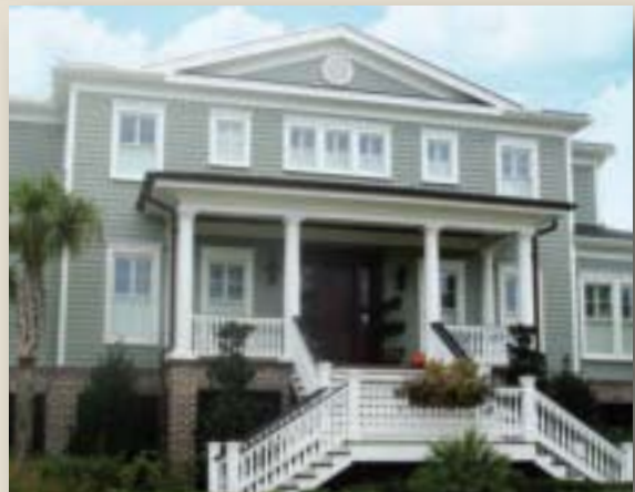
Sierra Premium™ Smooth