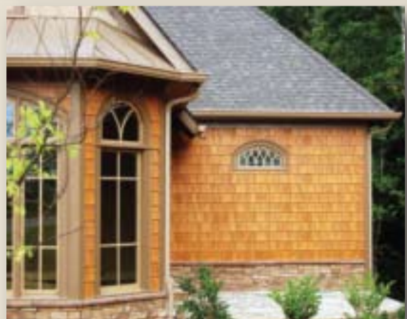
Sierra Premium™ Shake - Maple