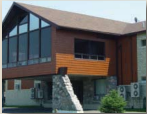
Sierra Premium™ Shake - Mahogany