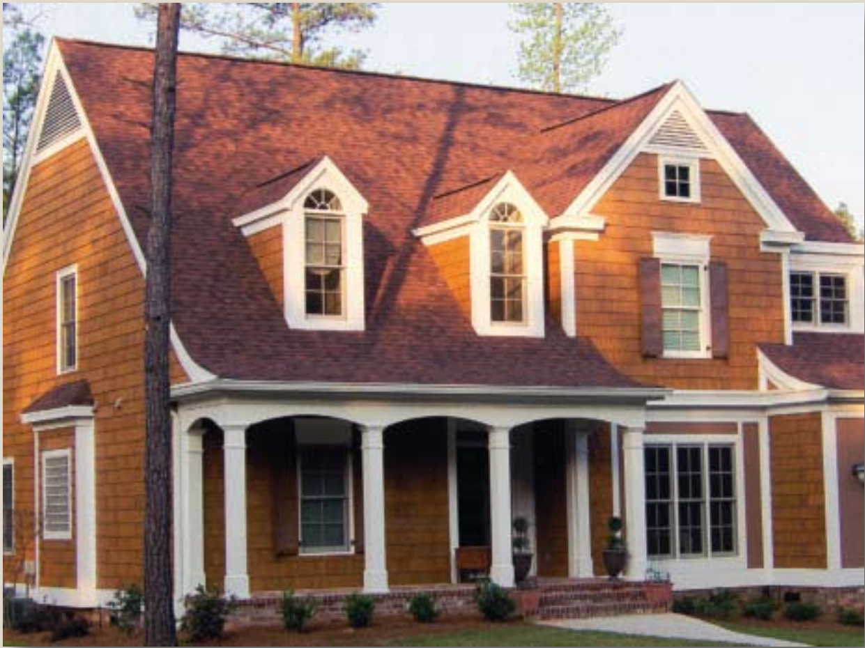
Sierra Premium™ Shake - Caramel