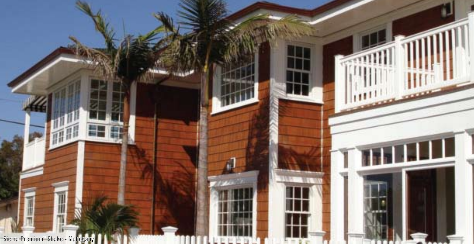
Sierra Premium™ Shake - Mahogany