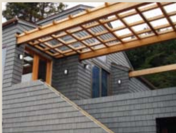
Sierra Premium™ Shake - Charcoal Gray