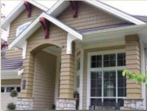
Sierra Premium™ Shake - Painted