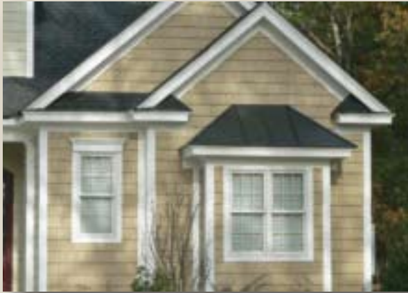
Sierra Premium™ Shake - Macadamia