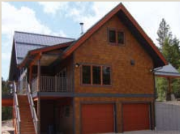
Sierra Premium™ Shake - Mahogany