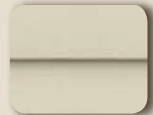
7" profile (shown lapped)